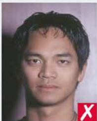
shadows behind head