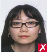
frames too heavy