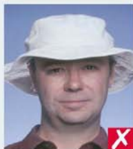
wearing a hat