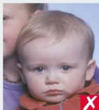
shows another person