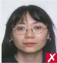
frames covering eyes