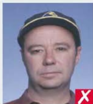
wearing a cap