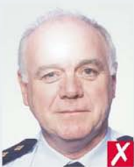
flash reflection on skin