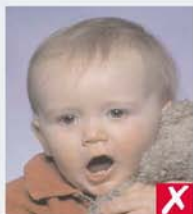
mouth open and toy too close to face