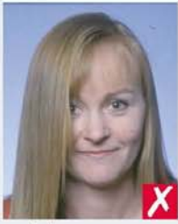
hair across eyes