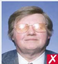
flash reflection on lenses