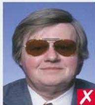
dark tinted lenses