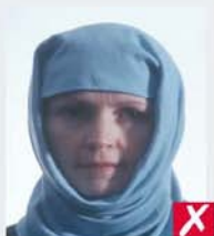
shadows across face